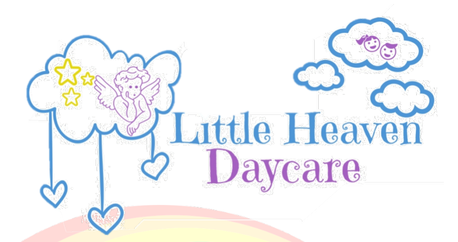
Photo Release Form/Policy on the Use of Technology and Social Media

At the Little Heaven Daycare we occasionally take photographs of children during special events or while just having fun throughout the day. We would like to post pictures of children on our page. You will be able to view school updates and your child's activities.